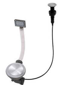
Space Push automatic waste fitting - PP 8407 116