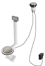
Space Light automatic waste fitting - PL 8407 117