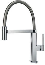
Mixer Tap GK 8488 000